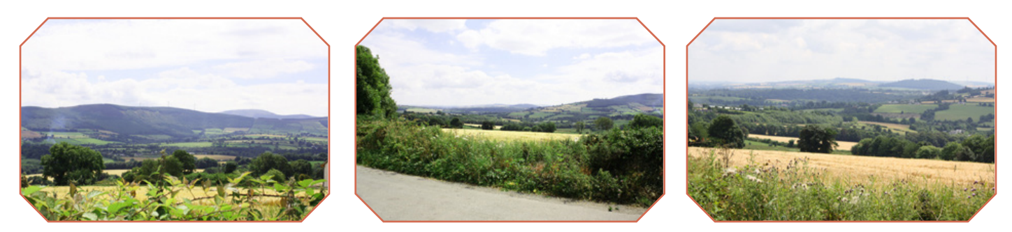
Some of the spectacular views from the highest point of this route

Turning west at the end of this lane it is necessary to cross the busy N80 road. On the opposite side "Ballinvalley Lane" (signposted L60664) awaits. A short walk uphill will bring you to the highest point on this route with spectacular views at every turn ( photos above ).