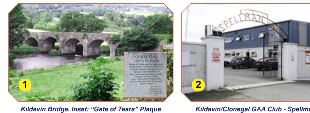
Kildavin/Clonegal GAA Club - Spellman Park