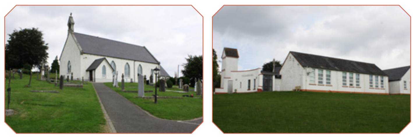
(a) St. Lazerian's Church