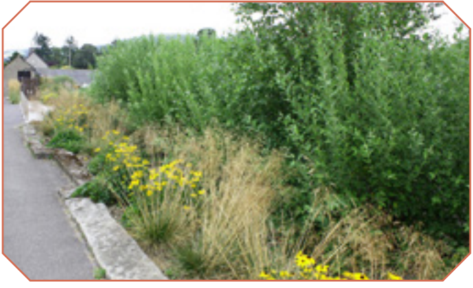
(d) Wildlife Garden