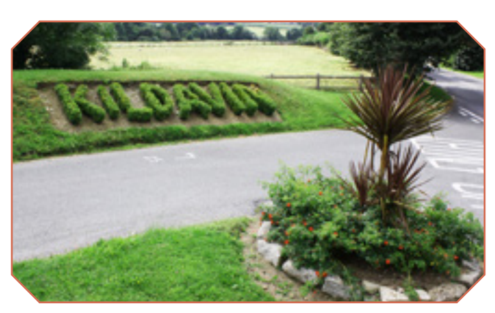
(g) Kildavin Box Hedging