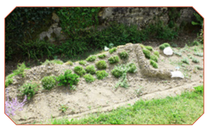
(h) Mother Earth Garden